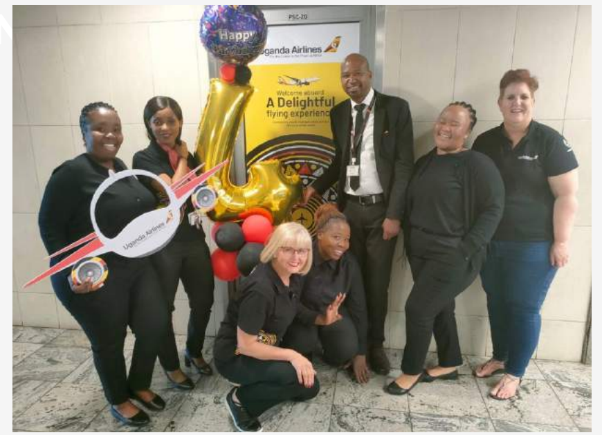
The AirlinePros International team celebrated the four-year anniversary of Uganda Airlines' first flight at the end of August.

UR currently flies between JNB and Entebbe five times per week.