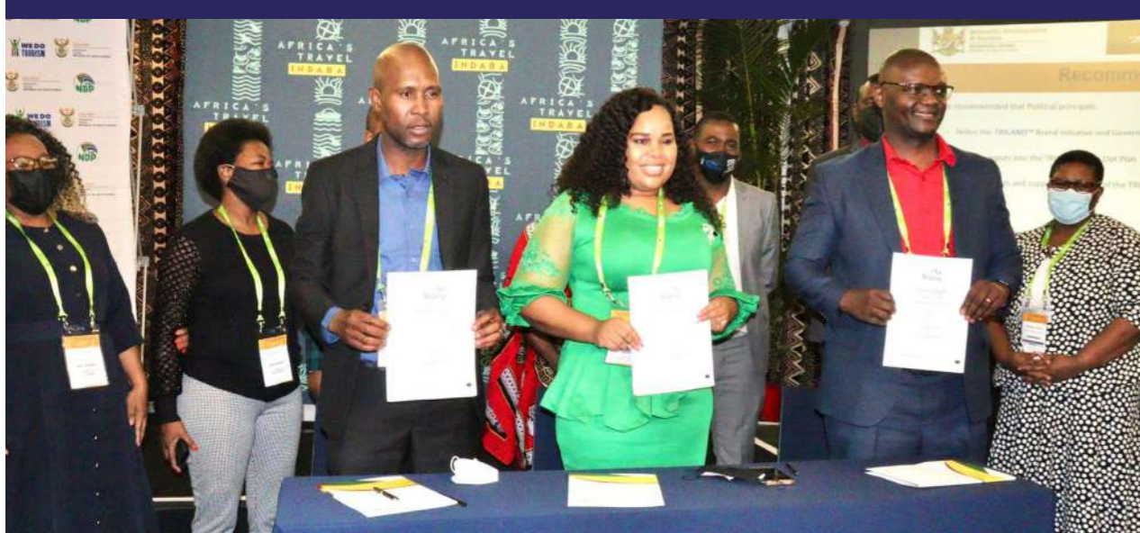
Pictured: Triland project partners signed an MoU at SA Tourism's Travel Indaba in 2022. According to stakeholders, a familiarisation was held in March this year to showcase the diverse products in each of the three Triland destinations.

Eswatini, Mpumalanga, and Mozambique are reviving their Triland tourism route project to promote trade and tourism across the three destinations. The aim of the project is to position Triland as a world-class tourism, trade, and investment destination.