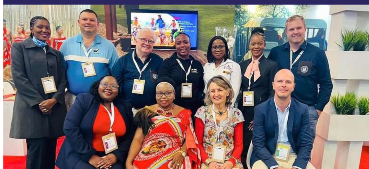
Pictured: Representatives from Eswatini Air had an opportunity to mingle with local and international buyers.

Eswatini Air was excited to showcase its regional network and in-flight products alongside several suppliers from Eswatini at the 2024 World Travel Market Africa event, held in Cape Town in April.