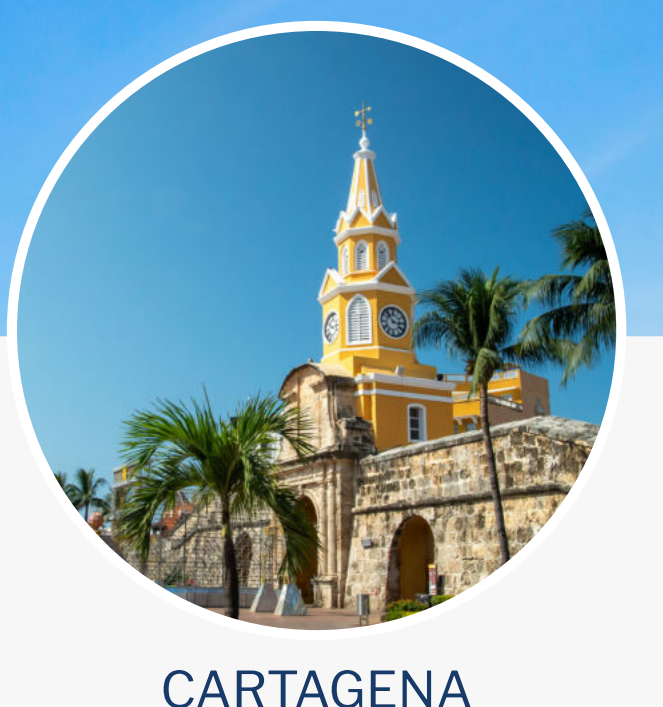
Click to read more