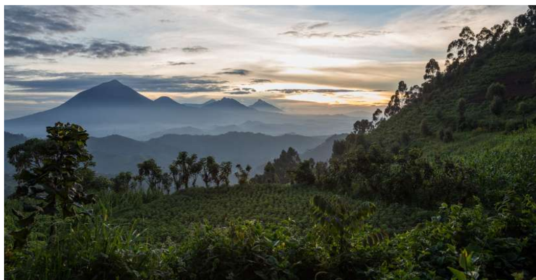
Bwindi Impenetrable Forest

Click here to explore these destinations